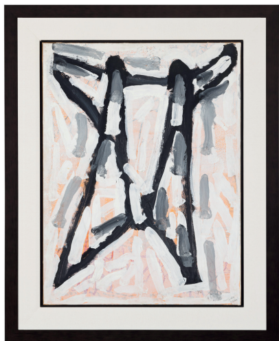
Jean Paul Riopelle, Ficelle-Fleurs , 1972, acrylic on paper mounted on canvas